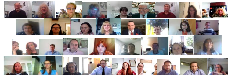
THE 2020 STANAG 6001 TESTING WORKSHOP